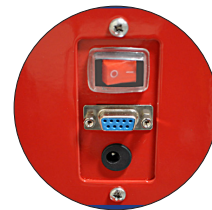
Power Switch & RS-232 Port